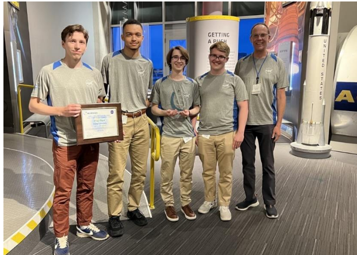
Winners of this year’s “Gateways to Blue Skies” challenge winners from Boston University were announced June 2 nd during the Blue Skies Forum at Glenn Research Center in Ohio.